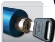
Manual Key Release